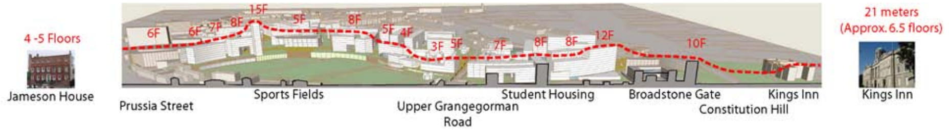
HEIGHT DIAGRAM E