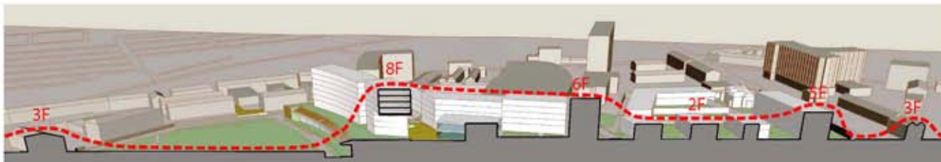
Kirwan Street Sports Fields St. Brendan's Way Business Maureen Potter Road HSE Mental Care North Circular Road