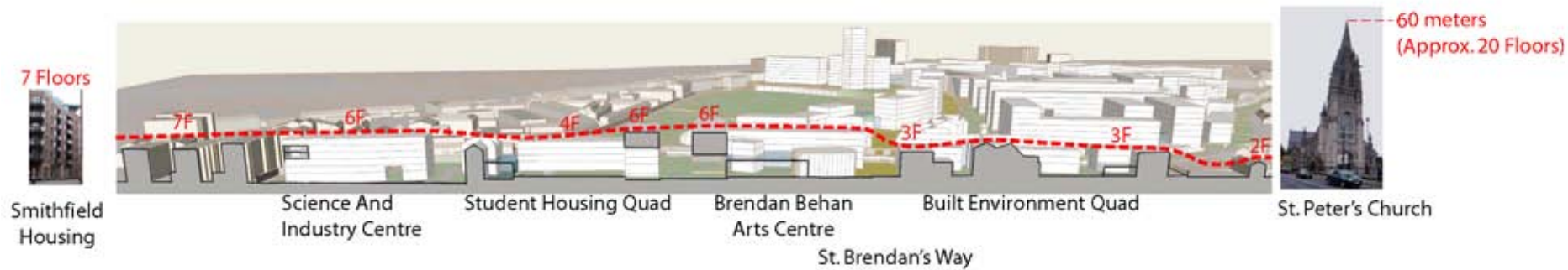
HEIGHT DIAGRAM D